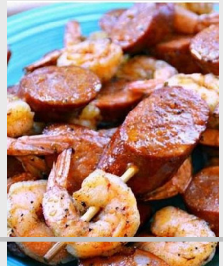
Shrimp & Sausage Bites

Warm baked meatballs with taziki sauce or warm tomato sauce with feta cheese