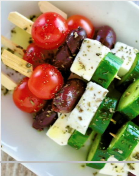
Greek Salad Skewers