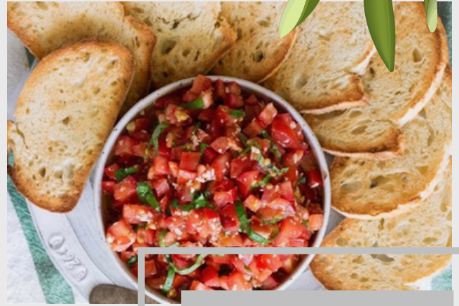
Fresh Basil Bruchetta

Warm baked meatballs with taziki sauce or warm tomato sauce with feta cheese