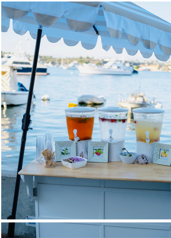
FROSE CART, MARGARITA CART, OR BEVERAGE CART