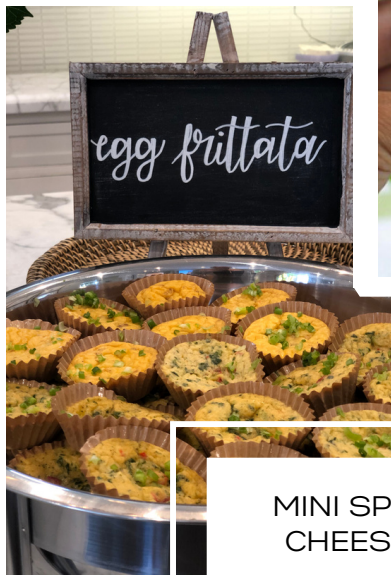
MINI SPINACH, EGG & CHEESE FRITTATAS